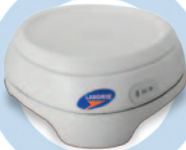
3 Urocap IV Wireless Uroflowmeter