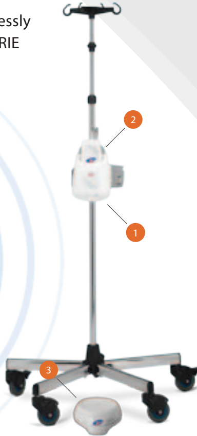
Pole Mount Option