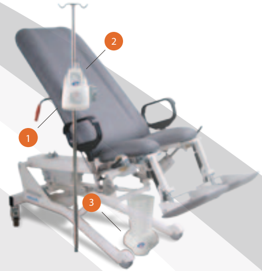
Procedure Table Option