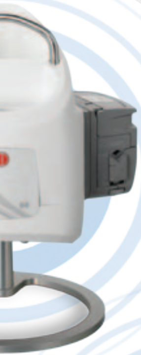
Goby Hub Urodynamic Processor